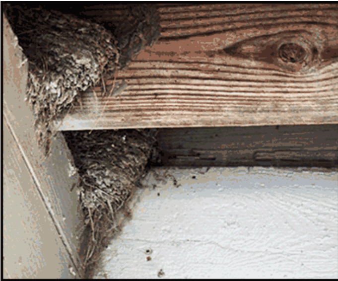
Barn swallow nest. They return every year to the same nest.