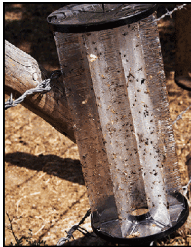
After three hours