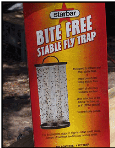
Stable fly sticky trap