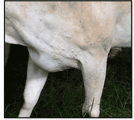
Welts from horn fly bites